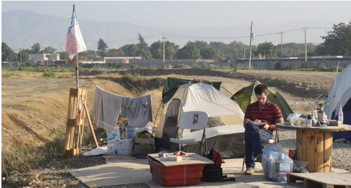
Figure 5: An evangelical NGO worker, camping at the UN Logistics Base in Port-au-Prince, flies a homemade Texan flag. © outreach-international.org, by Matthew Bolton, February 2010.

“[P]olicies cannot be effective if they are spread out among many different agencies, governments and NGOs” (Beebe & Kaldor 2010, p. 8).