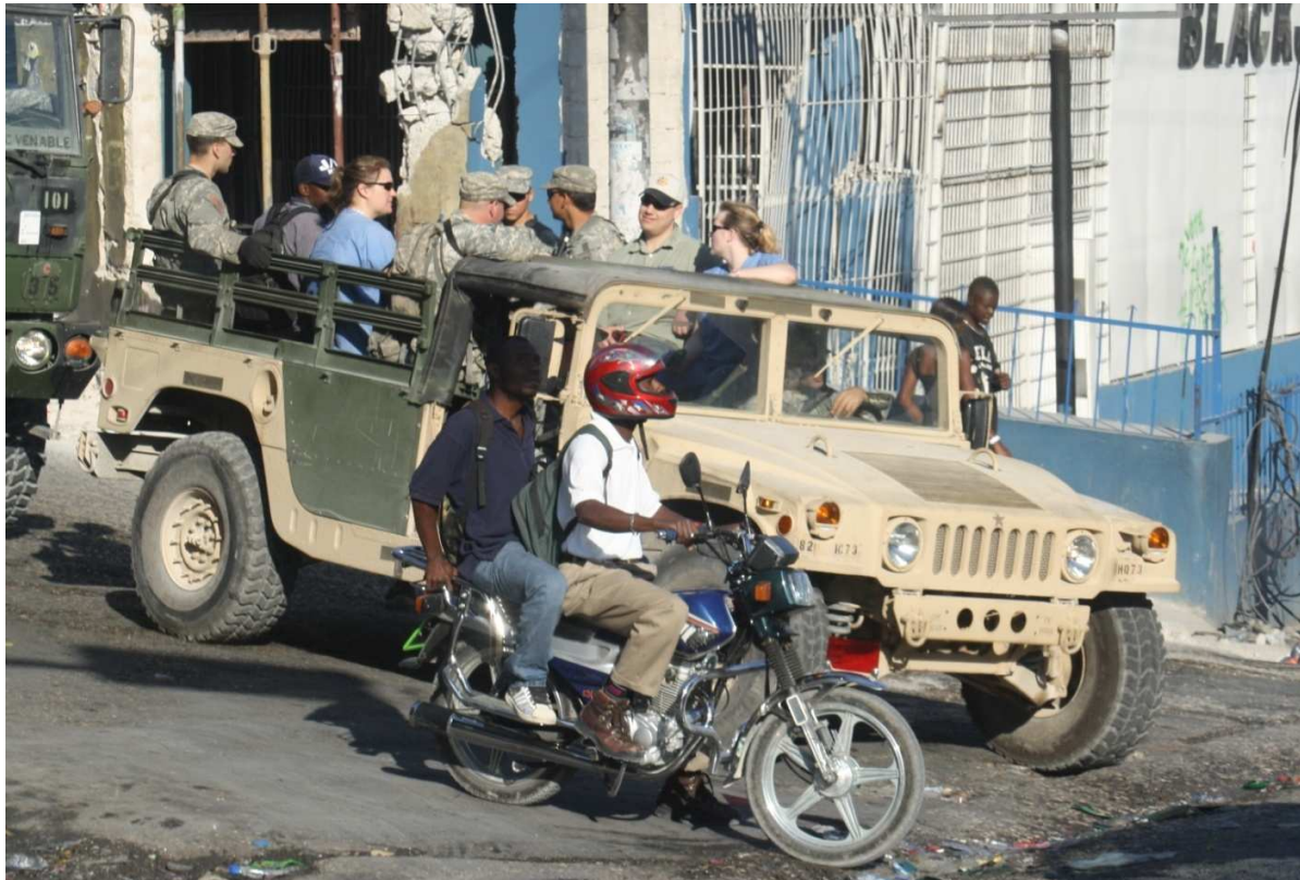
Figure 3: A US military vehicle on patrol in Petionville, a suburb of Port-au-Prince. Note the presence of foreign civilian medical personnel and a Haitian civilian in the vehicle. © outreach-international.org, by Matthew Bolton, February 2010.

Responding to, and intertwined with, Haiti’s post-statist and globalized security landscape, is an emerging political complex that governs the country through a network of global and local, public and private actors. This complex is reminiscent of theoretical work of Mark Duffield (1998; 2001a; 2001b; 2007), who has analyzed the ways in which political and economic power are exercised in the world’s insecure “borderlands” – those areas beyond the effective reach of nation-state authority. He demonstrates how the political economy of places like Afghanistan, Iraq, Sudan and Somalia fundamentally differ from traditional Weberian understandings of bureaucratic, centralized government. Rather, these so-called “complex emergencies” are governed by a shifting alliance, collusion and competition between UN agencies, international troops, private companies, NGOs, local associations, warlords, clandestine operators and ethno-nationalist movements.