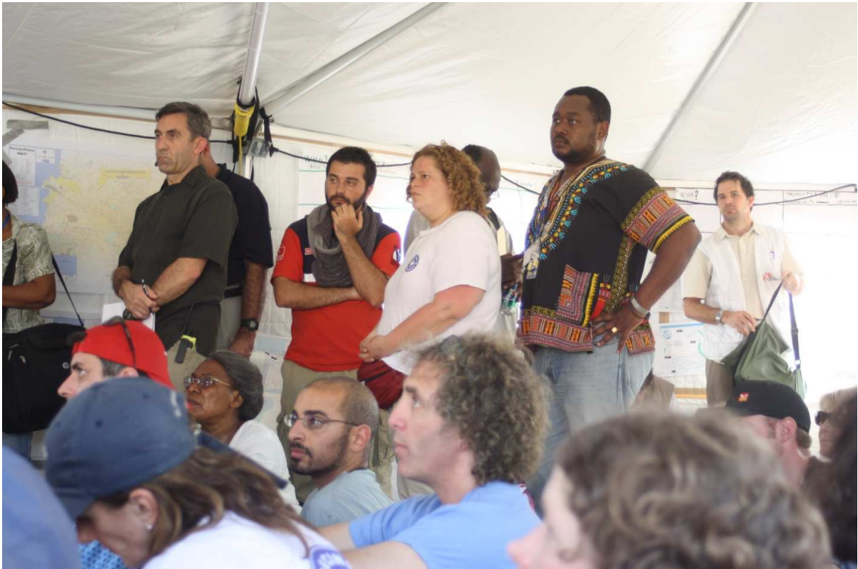
Figure 4: A meeting of the Health Cluster in a tent at the UN Logistics Base in Port-au-Prince. The meeting was held in English.

“In the long run, human security can only be provided by local authorities whom people trust. ... The job of outside forces is to create safe spaces where people can freely engage in a political process that can establish legitimate authorities” (Beebe & Kaldor 2010, p. 8).