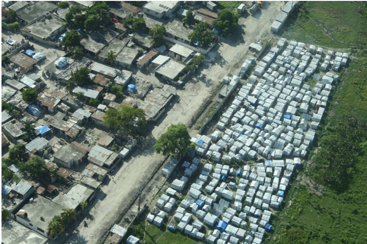
Figure 1: Displacement camp near Port-au-Prince Airport. © outreach-international.org, by Matthew Bolton, May 2010

Human security as a concept has been advanced by a variety of scholars and agencies that have critiqued traditional understandings of security. The literature on human security adds value to understandings of security, and thus to this paper, in three crucial ways. First, it recognizes that the state is not the only source of insecurity, or protection. Second, it argues that the object of protection, and of analysis, should be the individual human being, not the state. Finally, it acknowledges that existential threats to humans and their communities can come in many more forms than war and crime, for example natural disasters, climate change, poverty and disease. (UNDP 1994; Human Security Centre 2005; Glasius 2005; Kaldor 2007).