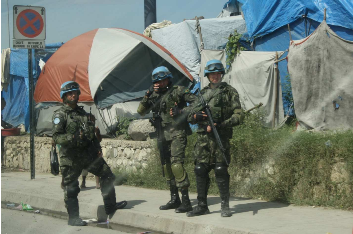
Figure 6: UN peacekeepers on patrol outside a tent camp near the Port-au-Prince airport. © outreach-international.org by Matthew Bolton, November 2010.

“In human security operations, civilians are in command. This means the military must operate in support of law and order and under rules of engagement that are more similar to those of police work than to the rules of armed combat. Everyone needs to know who is in charge, and leaders must be able to communicate politically with local people as well as people in the sending countries” (Beebe & Kaldor 2010, p. 9).