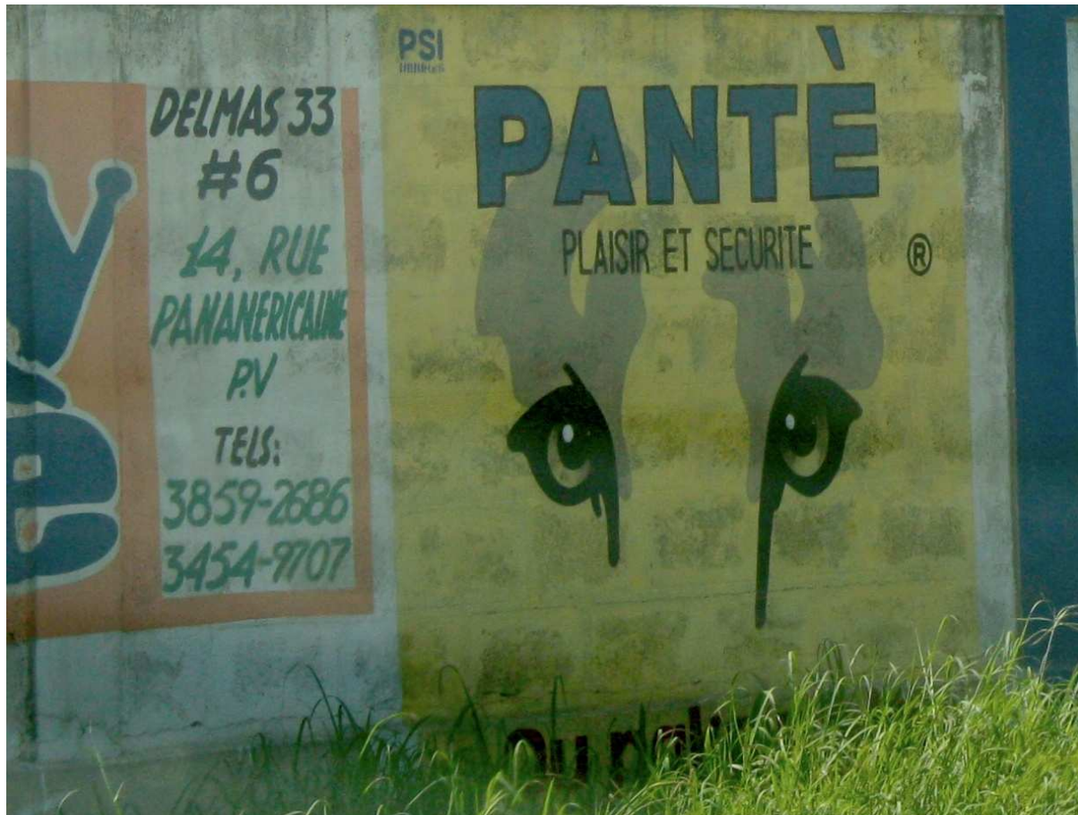
Figure 2: A condom advertisement in Port-au-Prince. © outreach-international.org, by Matthew Bolton, November 2010.

positions with the support of powerful international protectors such as the United States and France. Since the fall of Baby Doc in 1986, the Haitian state has cycled through periods of fragmentation, intense violence and instability. At times, the state has been the primary source of insecurity – as in the military junta period of the early 1990s – but criminal gangs and private militias have become increasingly powerful. (Weinstein & Segal 1992, p. 2; Mendelson-Forman 2006). Small arms have proliferated outside the state structures, with estimates of between 170,000 and 220,000 weapons in circulation (Faubert 2004, p. 26).