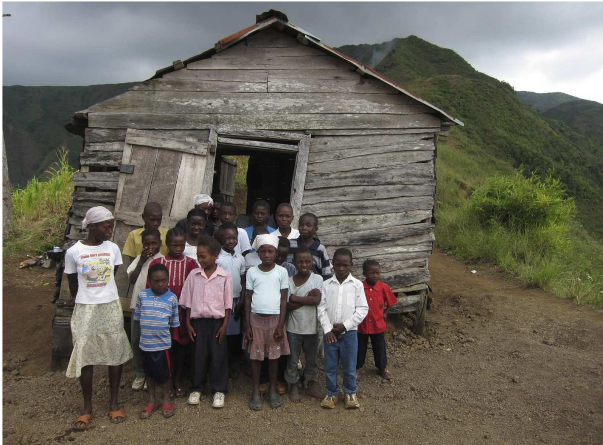
Figure 8: Small school in the remote rural areas of the mountains in the South-East of Haiti. © Article 25, August 2010.